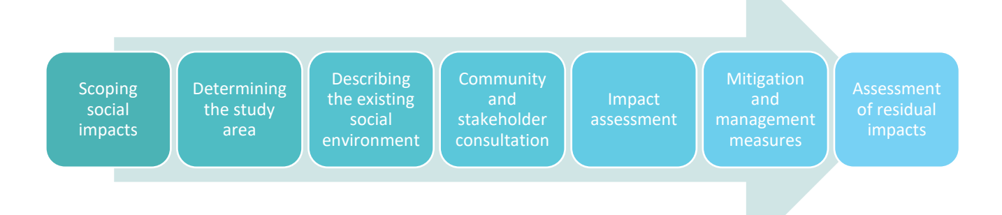
Figure 18.1 Overview of social impact assessment methodology

The methodology for this SIA has been designed specifically in response to the requirements of the Ministerial Guidelines for the project and followed the process outlined in Figure 18.1.