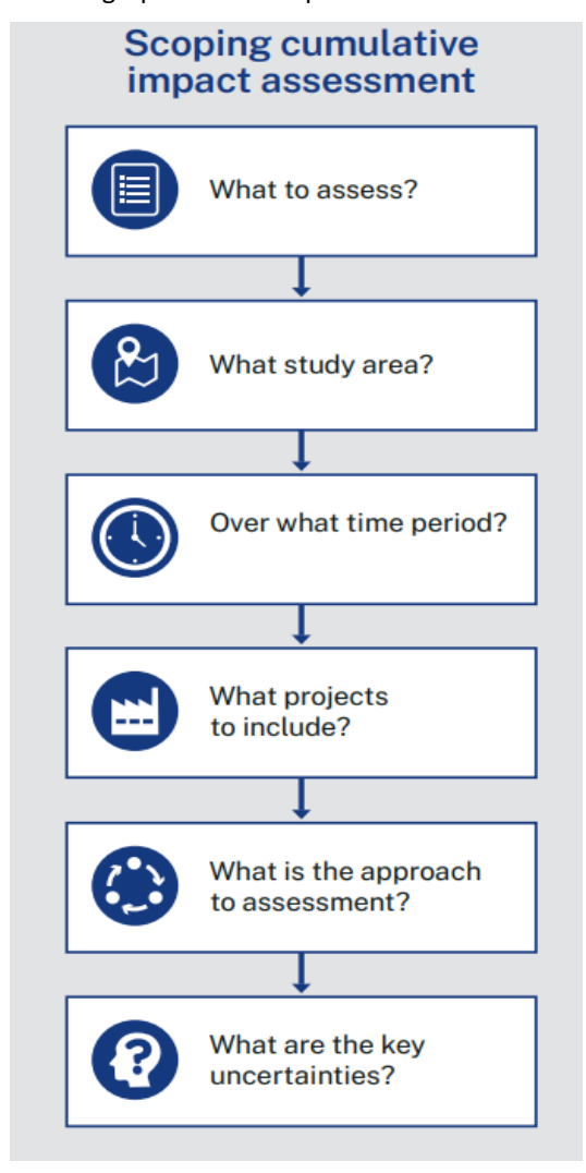
Figure 22.1 Approach to cumulative impact assessment

Chapter 8 (Facilitated changes) provides a description of facilitated changes required for other airports prior to the opening of WSI in 2026 to enable the new flightpaths and airspace for WSI.