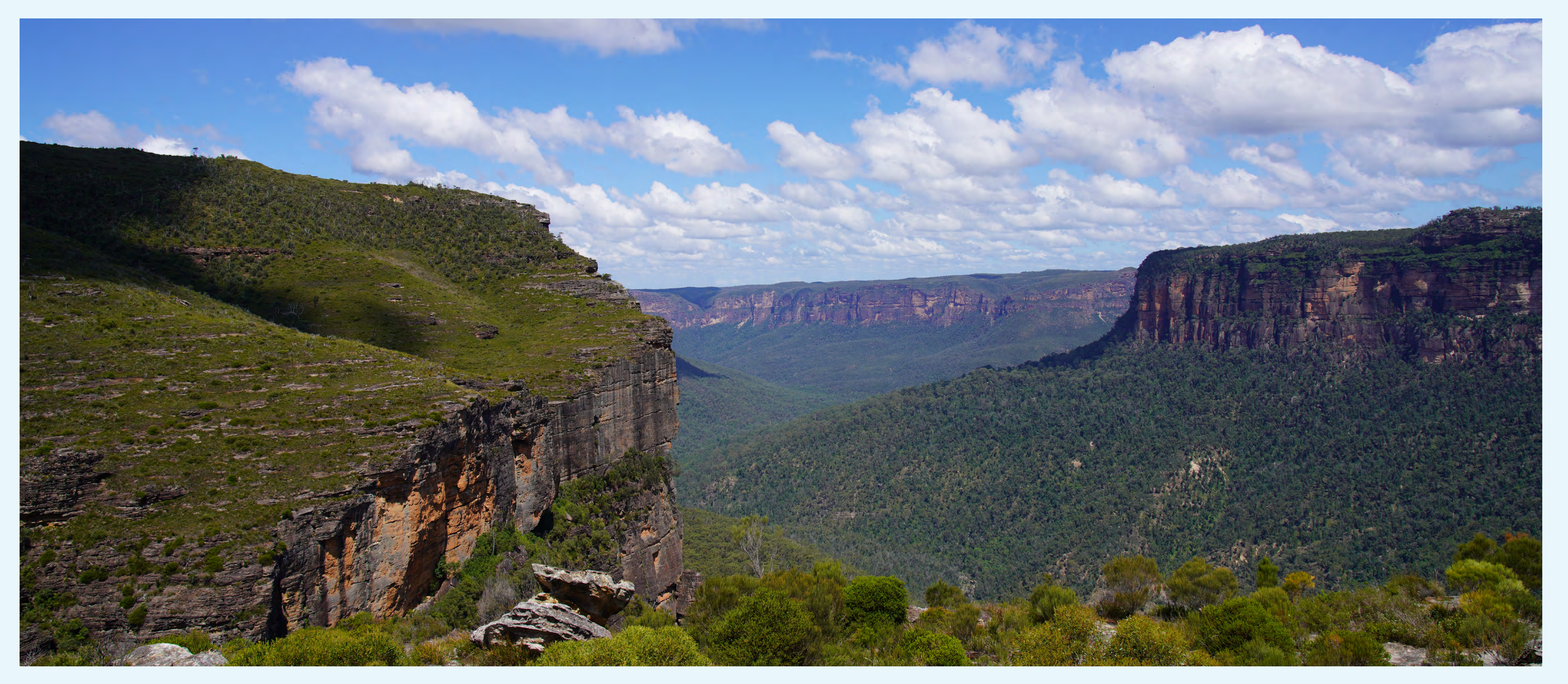
Blue Mountains character images